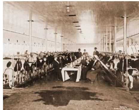
Hollywood Farm Milk Barn Dinner